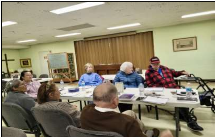
Advent Bible Study Group